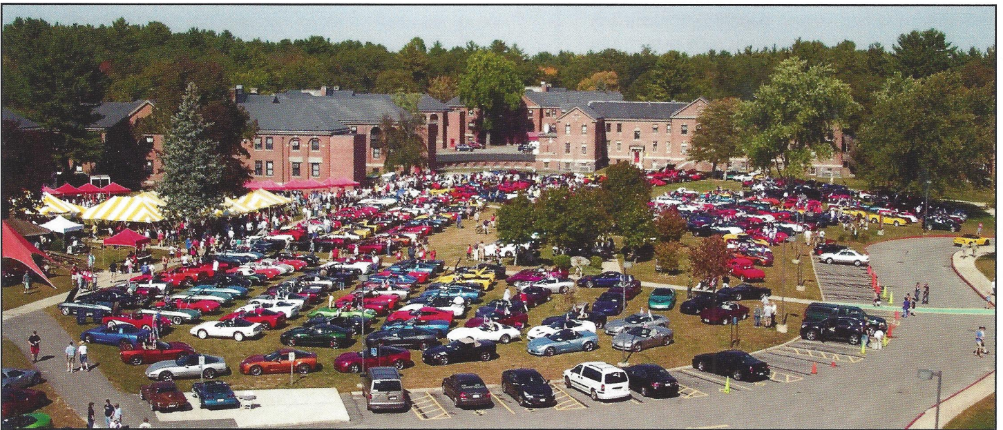
11th Annual Vettes to Vets Event 2014, Bedford Veterans Hospital

Please make checks payable to Vettes to Vets and note 'GPF 9001' in the memo section of the check.