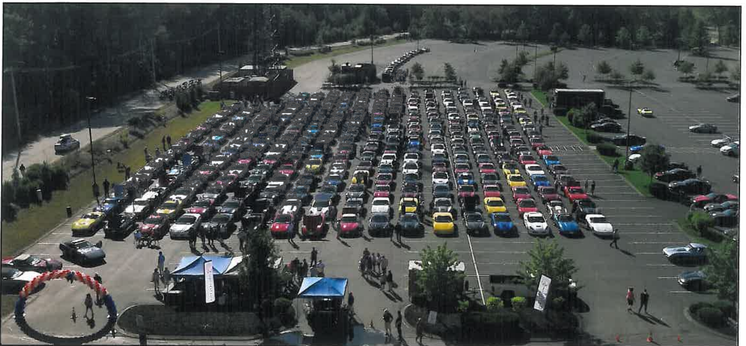
14th Annual Vettes to Vets Event 2017, staging area, Marriott Hotel

Please make checks payable to Vettes to Vets and note 'GPF 9001' in the memo section of the check.